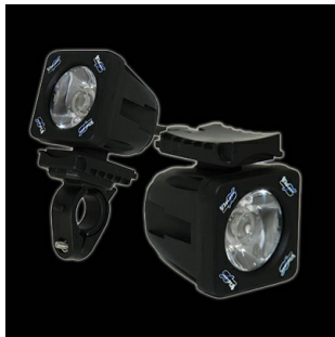
XIL-SCOMBO Light(s) not include