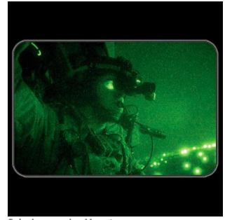
Solo Accessories Mounts s for use in portable